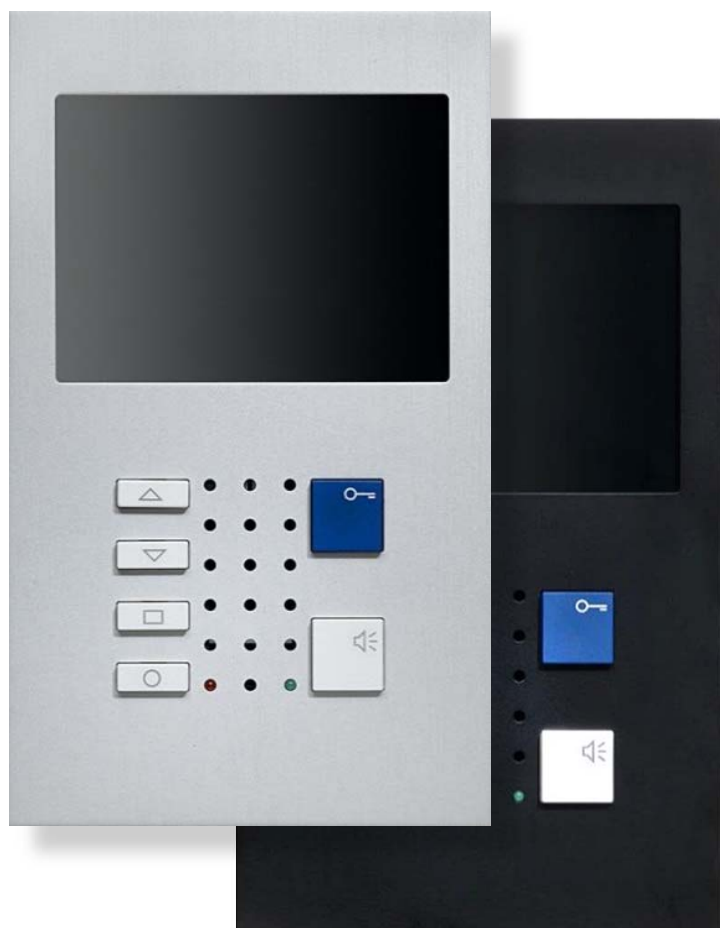
VTC42/Alu (anodized colorless or black)